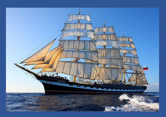
June, 6-14 Faroe Islands to Bordeaux (France)

A unique opportunity to access an intensive course on "Banking, Finance and Unconventional Risk Transfer", being trained by a team of best qualified professors, from some of the most prestigious EU HEIs and Enterprises, and spend a week on board of one of the largest traditional sailing vessels still in operation